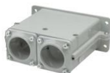
KF 221-56 x 2