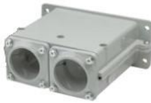
KF 221-56 x 2